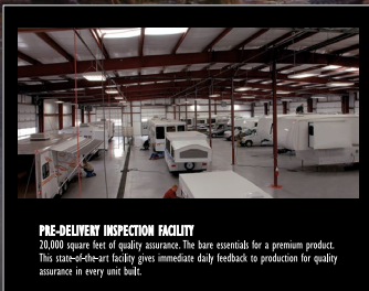
PRE-DELIVERY INSPECTION FACILITY 20,000 square feet of quality assurance. The bare essentials for a premium product. This state-of-the-art facility gives immediate daily feedback to production for quality assurance in every unit built.

ALL INFORMATION CONTAINED IN THIS BROCHURE IS BELIEVED TO BE ACCURATE AT THE TIME OF PUBLICATION. HOWEVER, DURING THE MODEL YEAR IT MAY BE NECESSARY TO MAKE REVISIONS. FOREST RIVER, INC. RESERVES THE RIGHT TO MAKE ALL SUCH CHANGES WITHOUT NOTICE, INCLUDING PRICES, COLORS, MATERIALS, EQUIPMENT, AND SPECIFICATIONS, AS WELL AS THE ADDITION OF NEW MODELS AND THE DISCONTINUANCE OF MODELS SHOWN IN THIS BROCHURE. THEREFORE, PLEASE CONSULT WITH YOUR FOREST RIVER DEALER AND CONFIRM THE EXISTENCE OF ANY MATERIALS, DESIGN, OR SPECIFICATIONS THAT ARE MATERIAL TO YOUR PURCHASE DECISION. *WHERE APPLICABLE. REV. 1-1-23